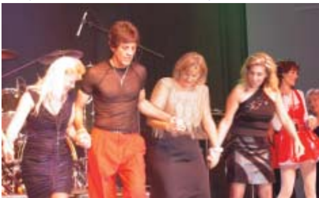
Deney Terrio teaches some willing guests a dance move.