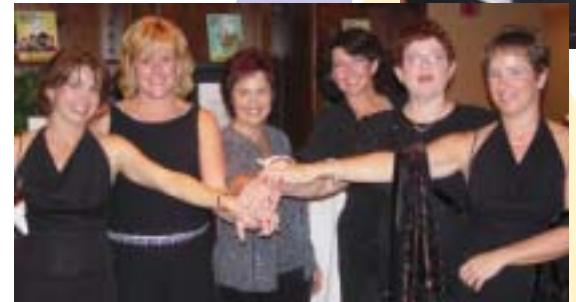
Children's Hospital staff members take part in event festivities.