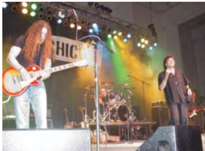
Mickey Thomas and members of the All-Star Band rocked their heart out.