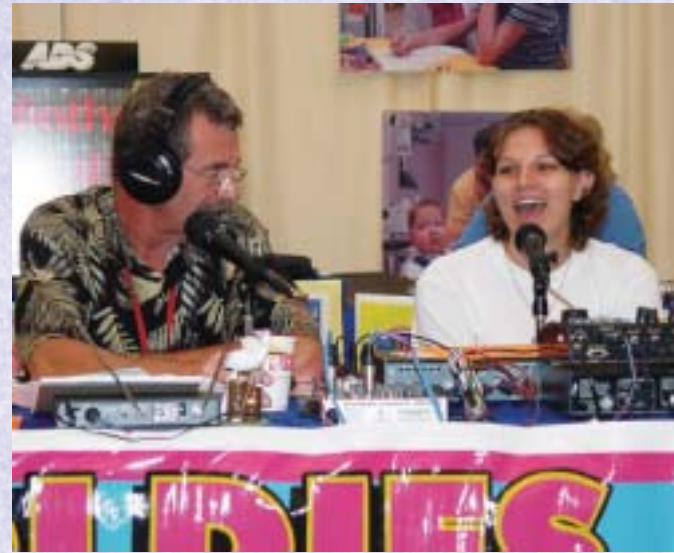
Radiothon 2004: Children with cancer who received care at The Children's Hospital shared their miraculous stories on-air.