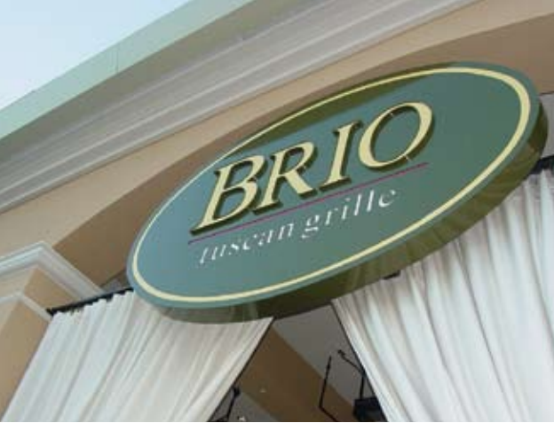
Making a grand entrance; the new Brio Restaurant.