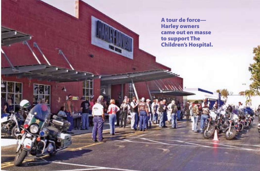
A tour de force—Harley owners came out en masse to support The Children's Hospital.