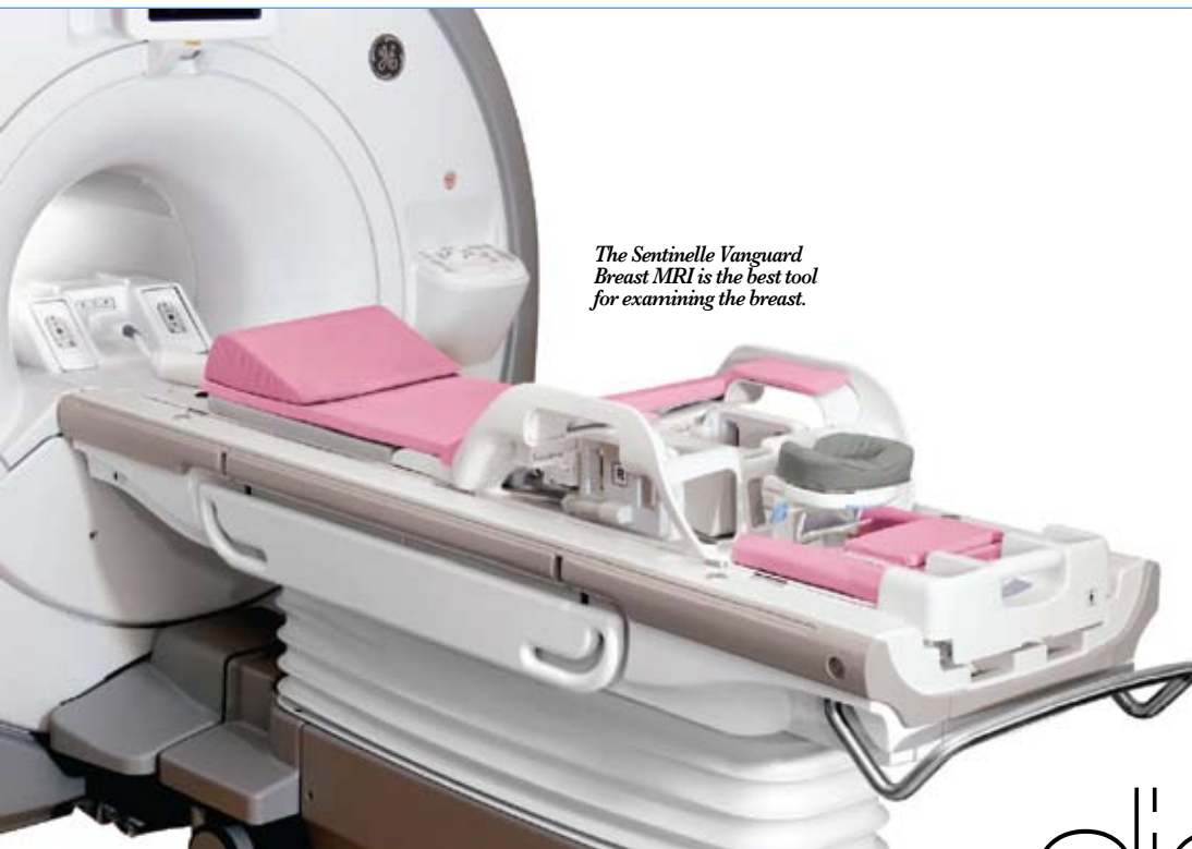
The Sentinelle Vanguard Breast MRI is the best tool for examining the breast.